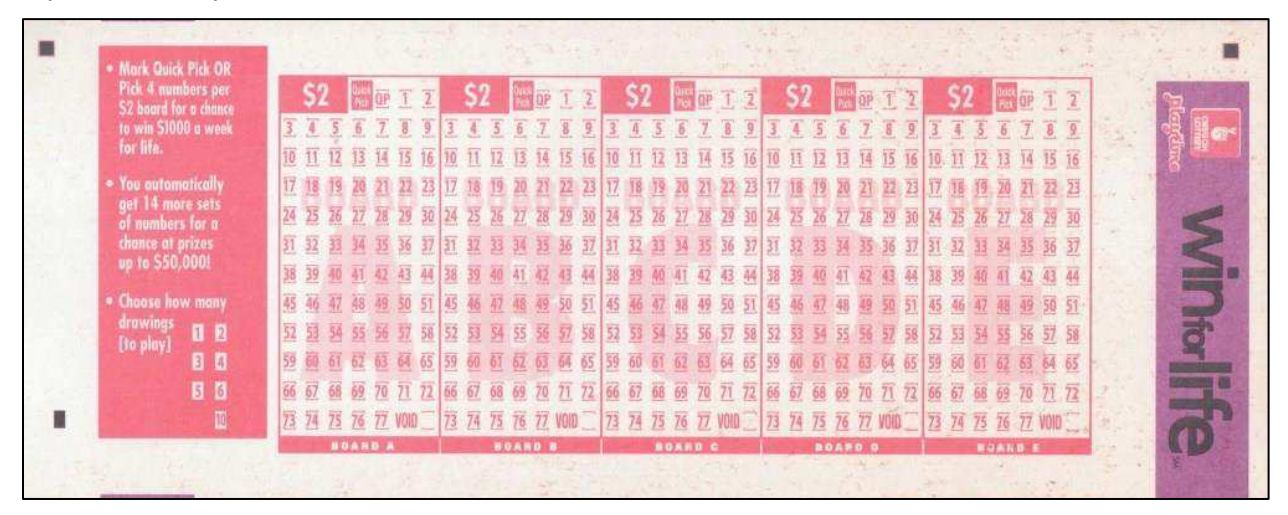
Figure 1 – Win for Life Game Slip

A blank Win for Life game slip is shown in Figure 1. The player makes his or her selections on the front side, while the back side explains how to play Win for Life, how to complete the game slip, and other pertinent information.