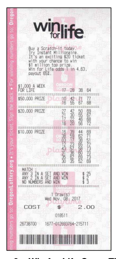
Figure 2 – Win for Life Game Ticket

The player then gives the completed game slip and the total amount wagered ($2 per filled out game board multiplied by the number of drawings to play) to a clerk at the retail establishment. The clerk inserts the game slip into a terminal that scans the game slip and prints a corresponding bar-coded ticket like the one shown in Figure 2, which is given to the player. Some locations offer player-operated vending machines that accept game slips and dispense tickets.